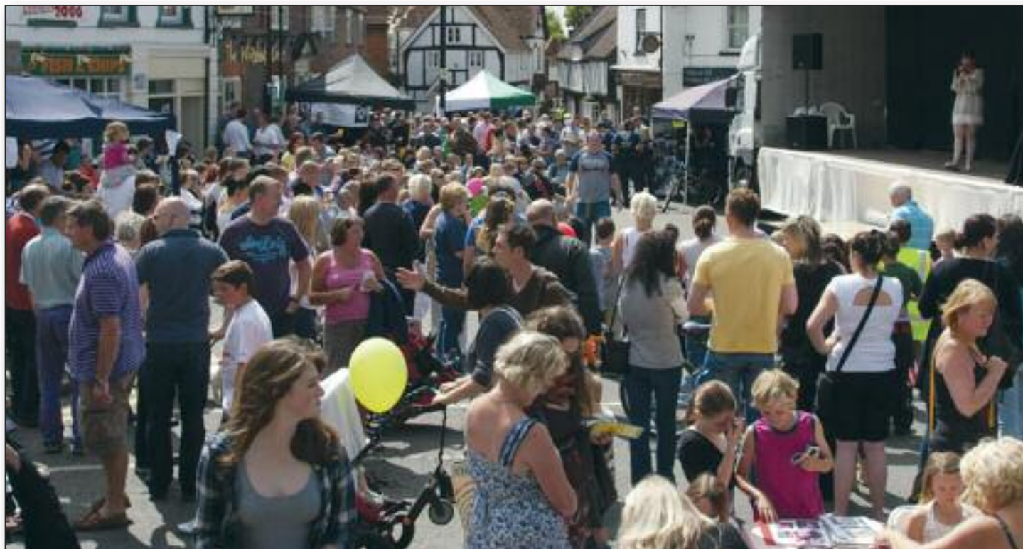
Crowds gather for festival week