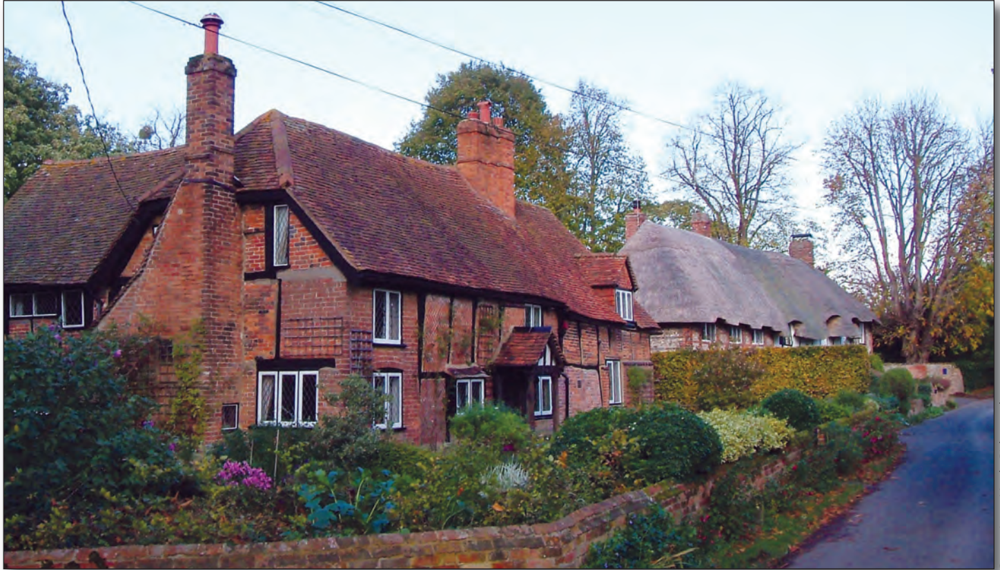
Burton Lane, Monks Risborough