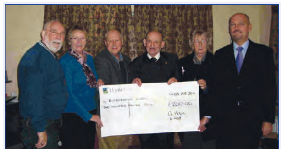
Cheque presentation to Risborough Cares.

Please show your support by using our car boot sales, not only can it be profitable; it can be good fun as well.