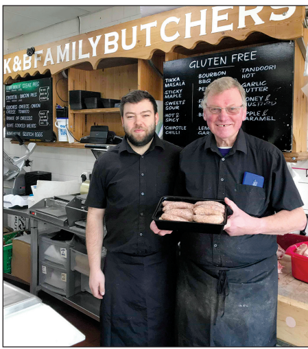
K&B Butchers present their Royal Sausages!

office and factory of royal bedmaker, Hypnos, whose family owners, the Keens, were awarded their first Royal Warrant in 1929. This fifth-generation family run business also hold a “Queens Award” for their services to International trade.