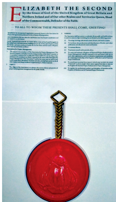
APM Order of Grant

Another organisation in Princes Risborough with a Royal Connection, and at the forefront of its respective field is the Association of Project Management (APM). This award-winning Association received notice of the