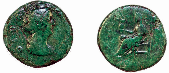
A fine bronze Roman Sestertius

Faustina Senior who died in 141 A.D. He honoured her memory by giving her the title 'Diva' or Goddess, as can be seen on the left of the obverse of the coin, which shows her head.