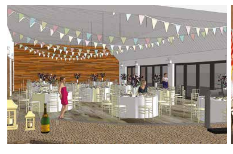
Proposed Internal View of the Cafe

© Complete Online! Alternatively you can complete this survey online by visiting the Town Council website www.princesrisboroughtowncouncil.gov.uk