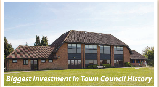
Biggest Investment in Town Council History