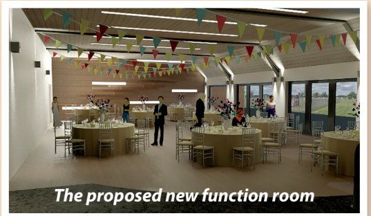
The proposed new function room