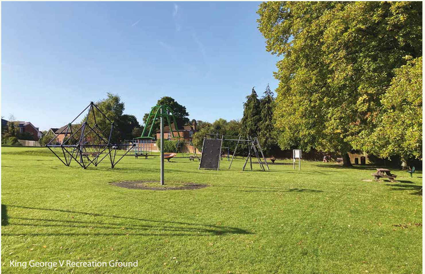
King George V Recreation Ground

The following facilities are available: children's play area (designed for children under 6 and fenced off), Multi-Use Games Area and a selection of adult fitness equipment.