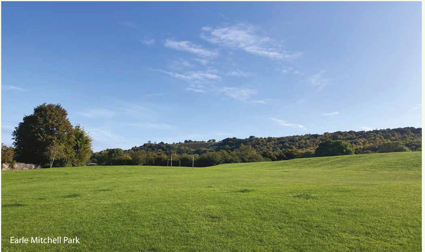
Earle Mitchell Park

Located above Salisbury Close and accessed from the Upper Icknield Way, Earle Mitchell Playing Field is a hidden gem. Nestled on the slopes of the Chilterns it overlooks Risborough's rooftops to the north and the Chiltern escarpment to the east. It is a truly beautiful spot.