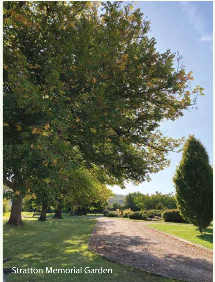
Stratton Memorial Garden