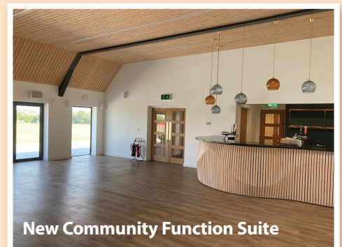
New Community Function Suite