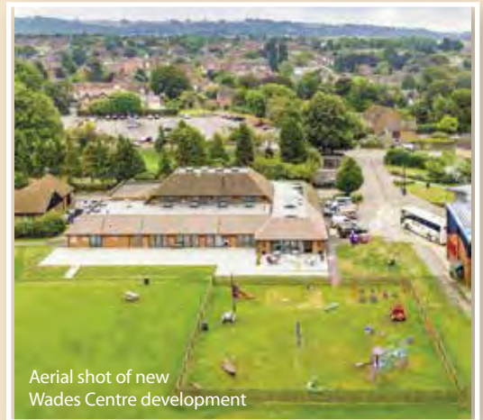
Aerial shot of new Wades Centre development