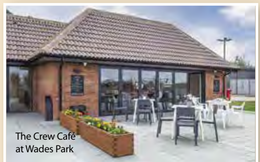
The Crew Café at Wades Park