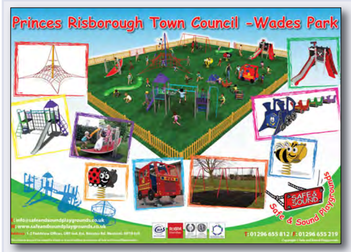
New toddler play equipment

After many years of under investment, we are delighted to confirm that a sum of money from section 106 developer contributions has been allocated to the Wades Park Play Area.