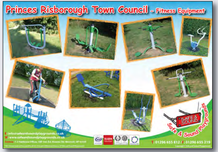
New adult fitness equipment

A plan has been agreed with the Council and installation should be completed by the Easter break (fingers crossed!).