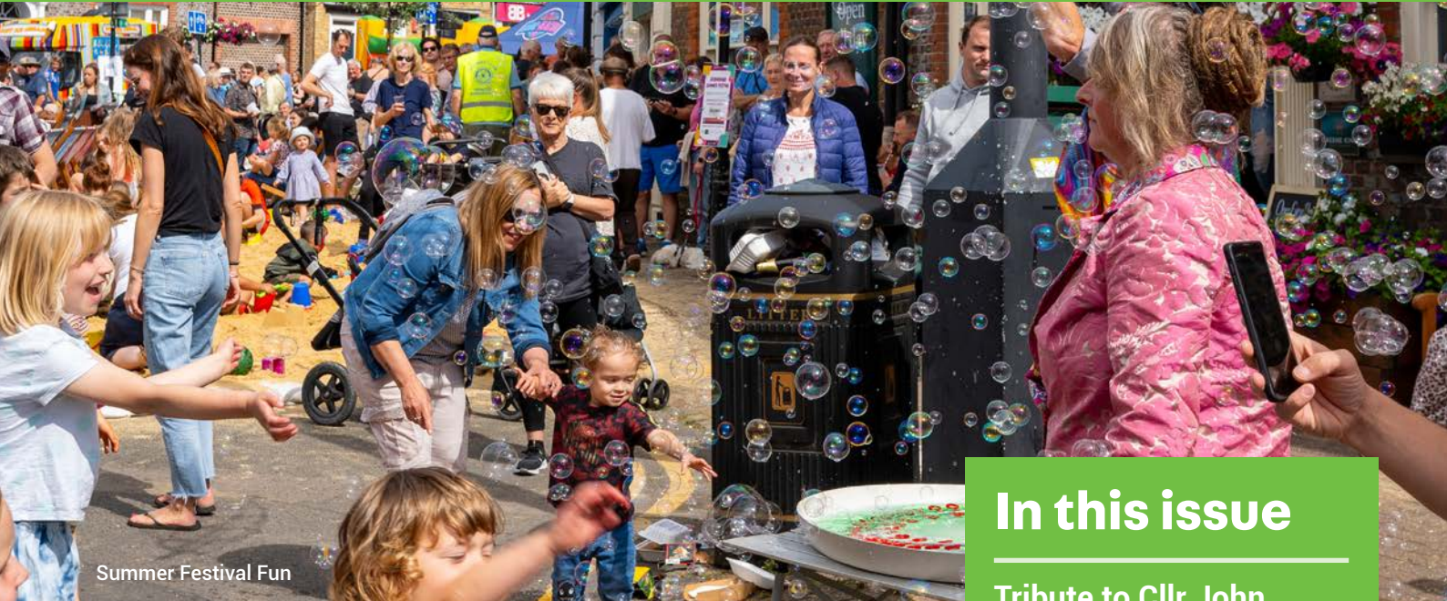
Summer Festival Fun